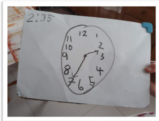
2 clocks showing the same time in different formats