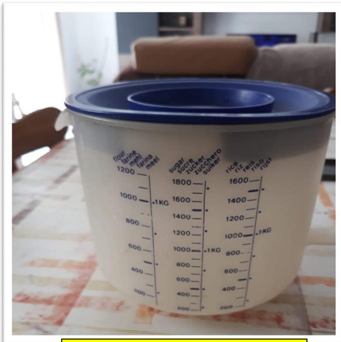
kitchen equipment to measure capacity