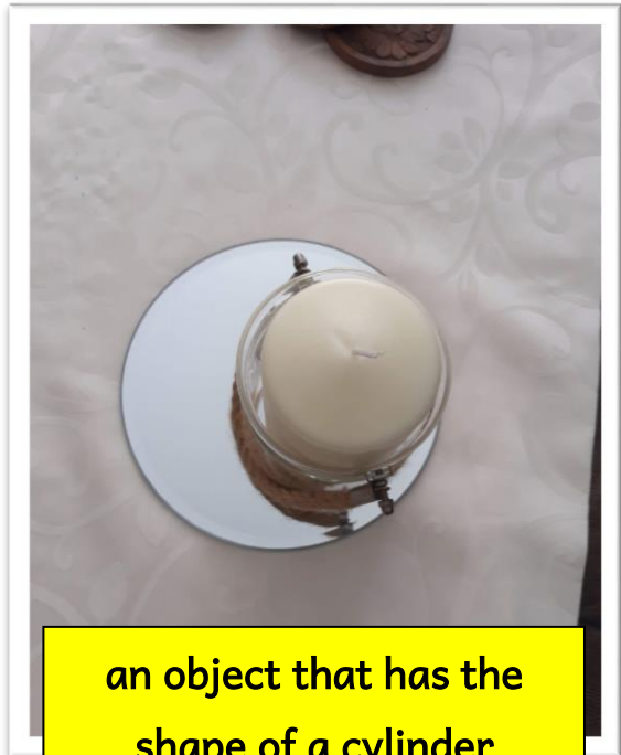
an object that has the shape of a cylinder