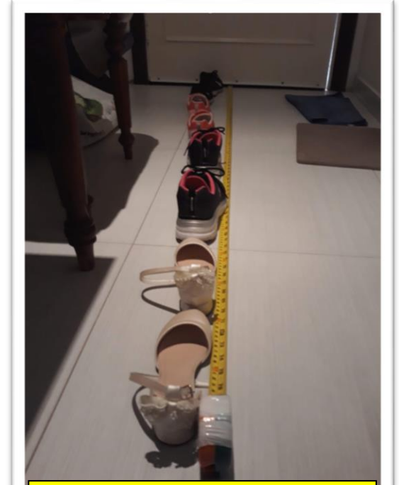
shoes in a line to show a length of 2 metres